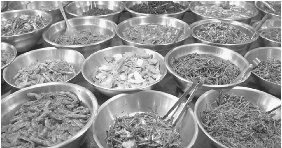
Metal bowls full of various types of kimchi (fermented and highly seasoned vegetables) in a market in Suwon, South Korea.

The variety and diversity of food available on the street in South Korea today have multiplied since the days of roasted sparrows. Rice cakes, kimbap , kimchi pancakes, skewered meats, and fish cakes are universal, but a global influence is increasingly apparent, particularly in Seoul and other large cities. One can find everything from hamburgers and hot dogs to Chinese dragon's beard candy, Turkish ice cream, and döner kebab. While Korean food itself has established its own international profile, so has its street food. In the United States, the neo-food truck movement of the first decade of the century was sparked in part by the Kogi BBQ truck in Los Angeles, a food truck serving a Korean–Mexican fusion of short rib kimchi tacos. This has come full circle as some enterprising vendors have begun selling kimchi tacos on the streets of South Korea.